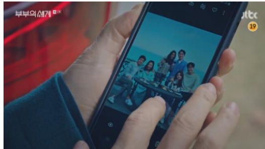
Fig. 2. Ji Sun Woo found another phone belonging to her husband.