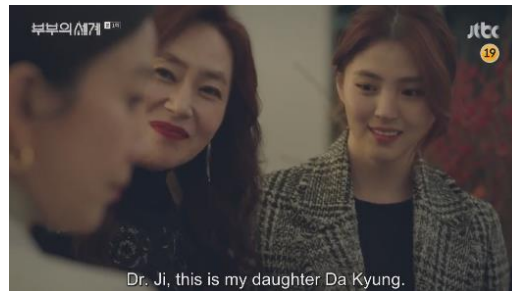
Fig. 1. When Ji Sun Woo first met her husband's mistress (Yeo Da Kyung).

Told in the first episode of the drama The World of the Married, it was told that Ji Sun Woo already knew about her husband Lee Tae Oh's affair with Yeo Da Kyung (Fig 1). When she found out about this, she still hoped that her husband would confess the mistakes he had made and that her family would return to the whole they were before. Likewise during the scene where she realized that the friends around her who she trusted were also betraye to hide her husband's affair (Fig 2) and instead sided with her guilty husband (Fig.3).