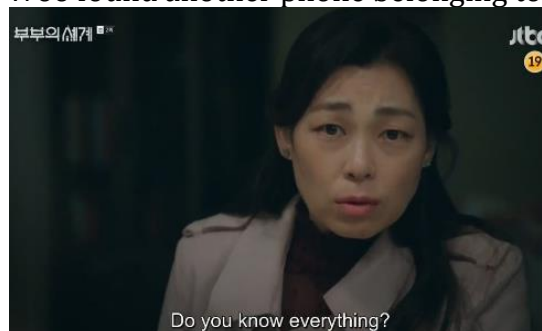
Fig. 3. Her close friends founs out that Ji Sun Woo already knew about her husband's affair.