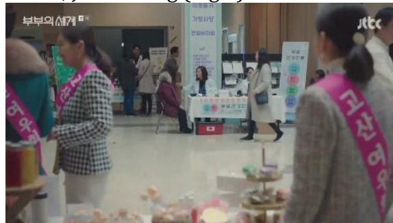
Fig. 5. Ji Sun Woo continues to work even though she is disappointed.

Professionalism is emphasized in Ji Sun Woo's character in the drama The World Of The Married , who is played as a doctor and the director of his hospital (Fig 5). She still has to work and be authoritative even though she is sad and disappointed, she is also still a good mother to her son, Joon Young (Fig 6).